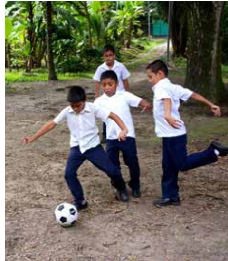
CENDIMOR youth playing soccer.