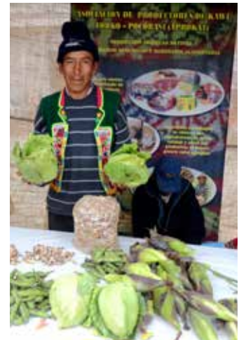
PRODII participant shows the produce he has grown. ▶

BOLIVIA is a landlocked country with a population of 10.2 million inhabitants. It is the poorest and least developed country in South America. 51% of the population lives in poverty, and 15.6% lives in extreme poverty. Most of the population (62%) is Indigenous. The life expectancy is only 67 years, and gender inequality is relatively high at 0.47. However, the educational attainment is the highest of the countries that we work in, with an average of 9.2 years of schooling for the adult population. In Bolivia, we are working with USC Canada partner, PRODII, in the areas of empowering women and increasing food security.