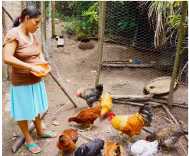
A small poultry in Loma Chata that was built with APRODAE support.

APRODAE is a community development organization working with rural communities in San José Guayabal. In this project, APRODAE works in four villages with 100 vulnerable people. They provide technical assistance for building 50 improved stoves, 50 small poultries, and eight demonstration plots of soybean. APRODAE also provides training in nutrition and healthy cooking.