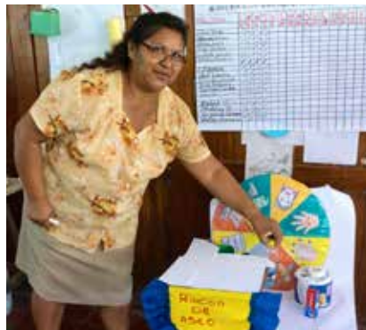
Materials provided by El Porvenir to learn about sanitation. ▼