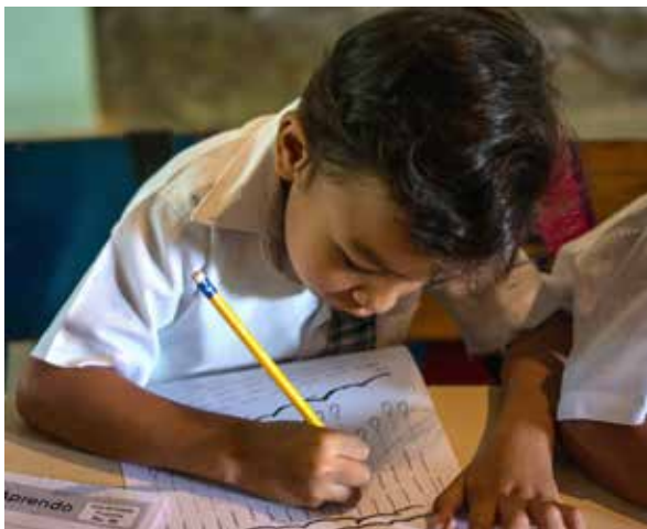
Boy in ANDAR's pre-school engaged in his schoolwork.