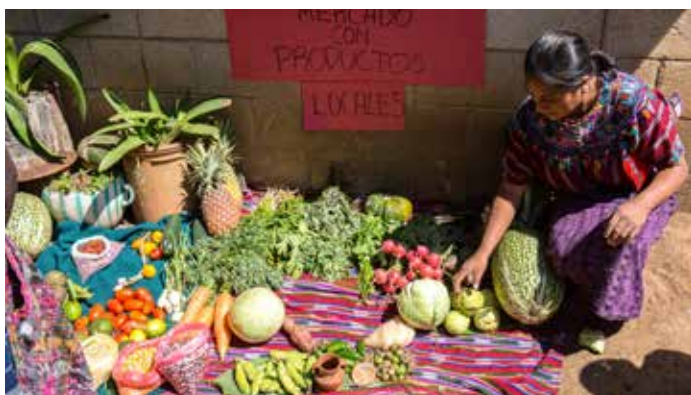
Display of produce grown by ADEMI women.