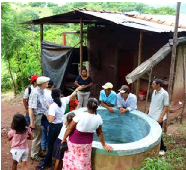
Kenoli team talking with people in Las Cruces about their work.

El Porvenir improves rural living conditions through water and sanitation projects. In this project, Kenoli supports the training of 60 new community educators and 120 teachers, airing radio programs on hygiene and sanitation, testing water quality, and conducting school and public education campaigns.