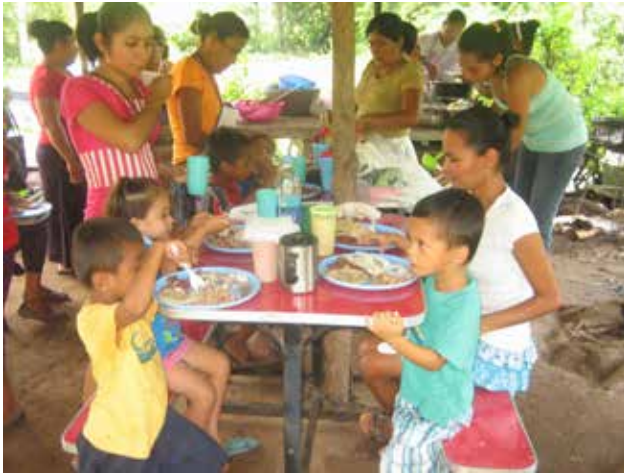
Mothers and children participating in the FUSANMIDJ program enjoy a healthy lunch.

FUSANMIDJ strengthens vulnerable populations through provision of training, leadership development, and advocacy. In this project, they are improving the health of 100 malnourished children by training their mothers on healthy nutrition. FUSANMIDJ also trains eight new community health promoters, works with 10 families to plant soy and peanuts to improve local access to protein, collaborates with four public schools on educational campaigns, and purchased a new vehicle.