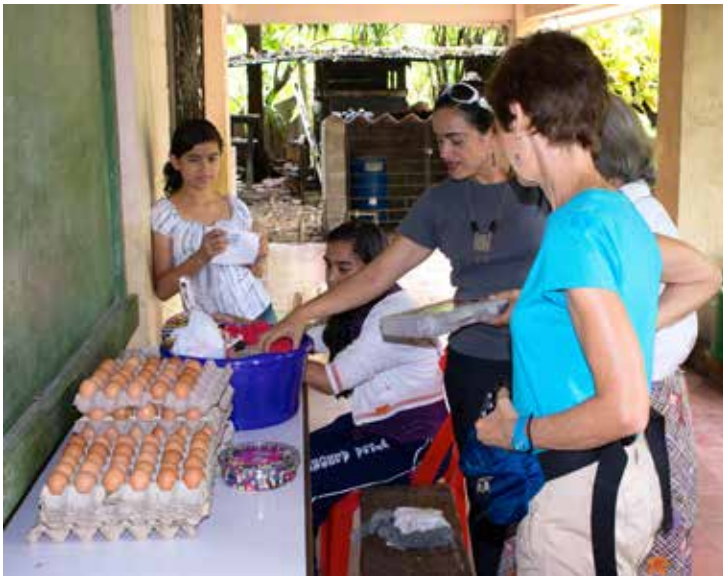
The Kenoli team views the eggs, which now provide protein for the children and a source of income for the centre.