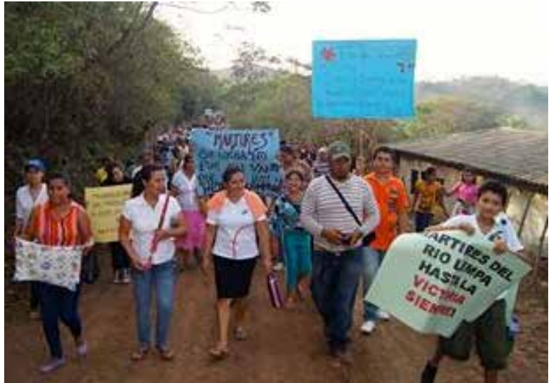
Residents of Santa Marta commemorate the massacre of 150 people by the military in 1981.

EL SALVADOR experienced a military coup in 1972 and a civil war from 1980-92, which left a very violent society with high levels of poverty. 34.5% of the 6.3 million inhabitants live in poverty. While still high, the homicide rate has decreased from 70 violent deaths to 41 per 100,000 inhabitants 1 with recent developments. We have seven excellent partners in El Salvador working in food security, nutrition, health, opportunities for women and youth, human rights, and consumer rights.