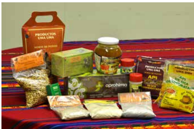
Products that the farmers of Northern Potosi produce and sell.