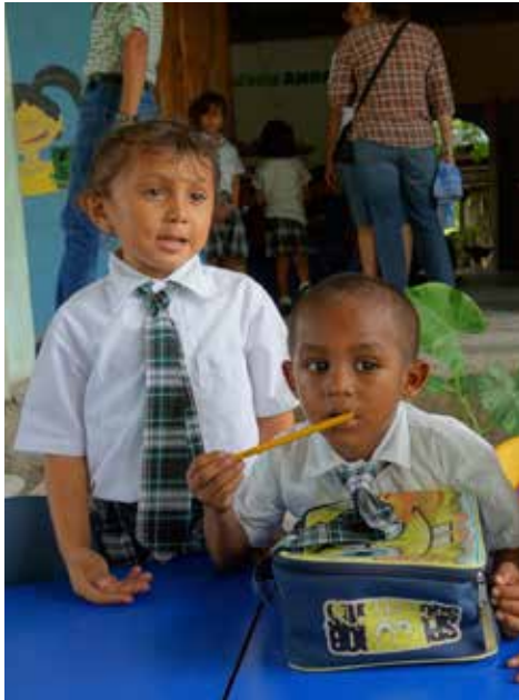
Children in ANDAR's preschool.

HONDURAS is the most violent place on earth with a homicide rate of 90.4 violent deaths per 100,000 inhabitants. The country experienced military rule from 1963-83, and in June 2009 had a coup d'état, leading to political instability and human rights abuses. 60% of the population lives in poverty with nearly 18% living in extreme poverty, 4 making it the poorest country with which we work. We have seven amazing partners who are working under very difficult conditions. They are working on women's empowerment, the support of vulnerable preschool children, technical training for youth, food security, economic development, and holistic community development.