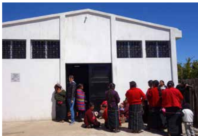
With ADAM's support, the women of Xeabaj II raised funds from the municipality to build this new community centre.

ADAM supports the economic development of rural farmers. In this project, ADAM works with Mayan women living in extreme poverty in the community of Xeabaj II in Sololá to strengthen their economic initiatives and to provide literacy training. The women manage revolving funds for steers, grain silos, organic worm composts, and vegetable production. The women have become more empowered, strengthened their vulnerable economic situation, and attracted other funds into their community from government and non-profit sources.