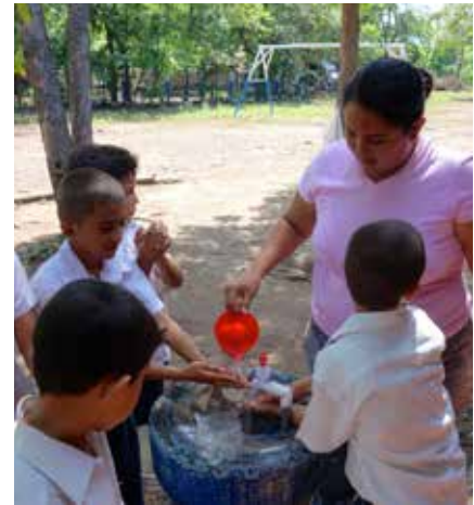
Children at El Zarzal school wash their hands with their teacher's help.