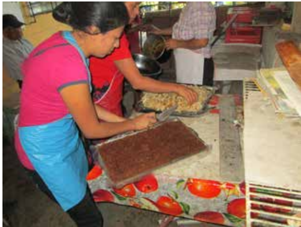
ACIDES women preparing their products for sale.