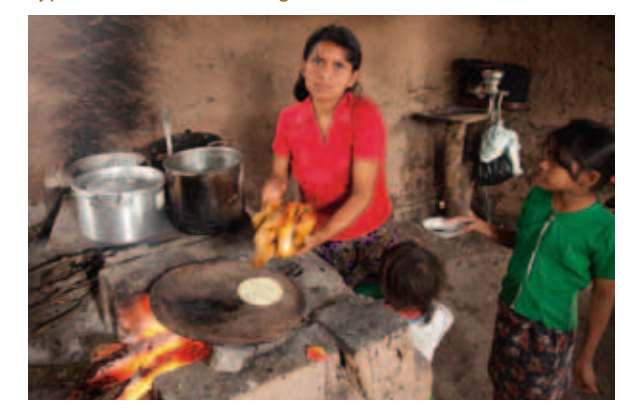
Improved stove with ventilation