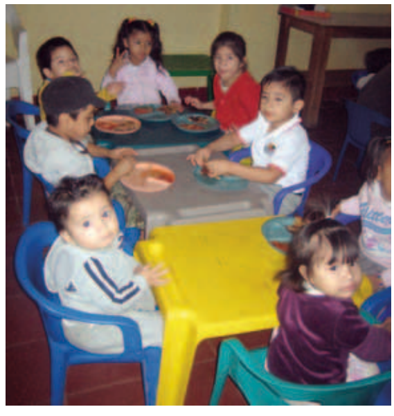
Malnourished children at CENDIMOR's school

The republic of El Salvador is the smallest and most densely populated country in Central America, with 6.7 million people. In the 1980s and early 1990s, El Salvador was torn apart by civil war that was sparked by extreme inequality. While a ceasefire was negotiated in 1992, the scars of war have contributed one of the most violent societies in Latin America. Poverty continues to plague the country as nearly a quarter of the population lives in extreme poverty. One in six children suffers from chronic malnutrition. 90% of the country's natural water is contaminated and half the population drinks untreated water. Social disruptions and family breakdown have increased as emigration has sky-rocketed. One in five Salvadorians now lives outside the country.