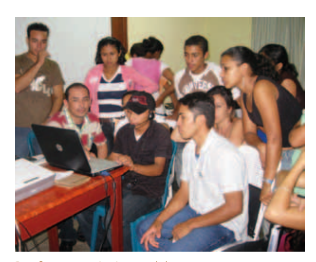
Desafios communications workshop

Desafios works to empower youth through communications, leadership training and citizenship participation. Kenoli support is contributing to the creation and strengthening of the Nicaraguan rural youth network (RENIJUR), so that the rural youth will become involved in the development of their communities and influence public policies. Over 800 youth are involved and they are already beginning to impact their communities.