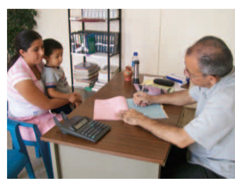
Doctor assesses malnourished child

CENDIMOR is a local Salvadorian organization that supports children living in extreme poverty in the Soyapango area. The organization provides pre-school and after school education, as well as, nutritional support. Kenoli is supporting CENDIMOR to build its organizational capacity through the development of a three year strategic plan, an operations manual, a new computer, an updated accounting system and a proposal to government for ongoing funding.