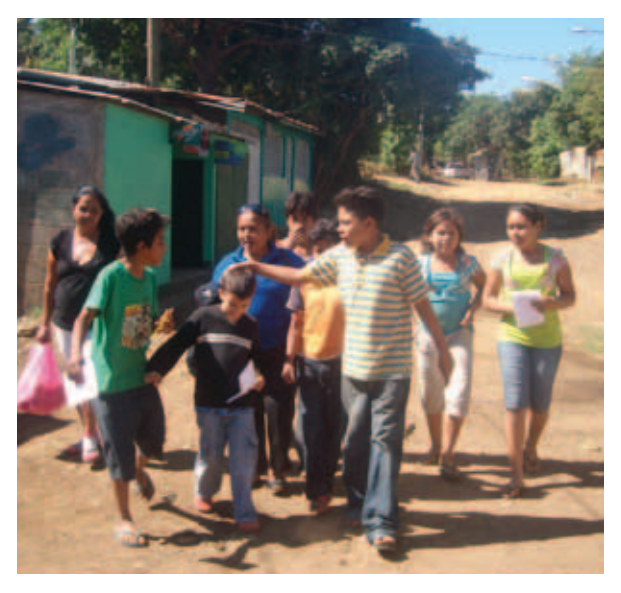
Los Quinchos organizing street children