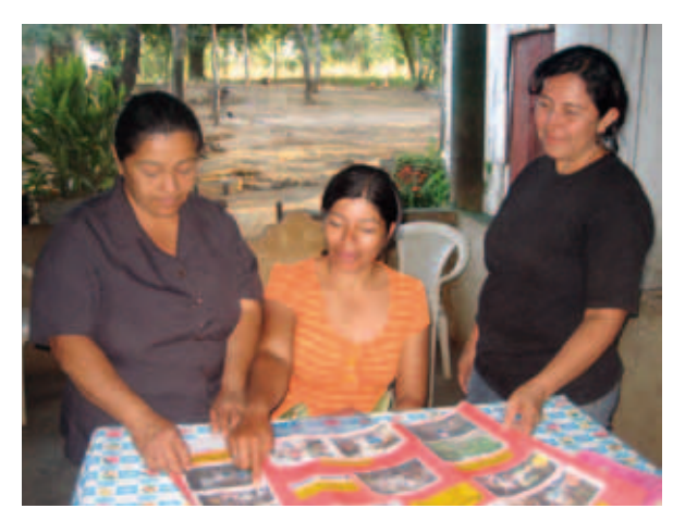
CEPROSI women discussing their work in the past year

Los Quinchos works to prevent of all forms of violence against children and adolescents. The organization also promotes the reintegration of abused children into society by helping to strengthen families and communities. The Kenoli sponsored project will provide 80 children and youth, who are vulnerable to the sex trade, with educational workshops, sports, arts and cultural opportunities in three community houses in Managua. Los Quinchos will also educate the community on the importance of preventing domestic and sexual violence.