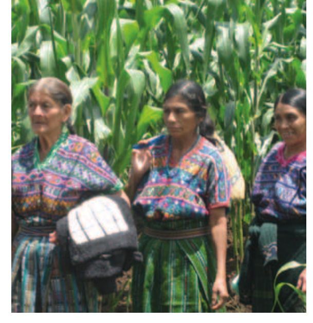
► Mayan women with CONIC

CONIC is a national organization of Mayan farmers that works with 655 communities in 13 departments in Guatemala. The project sponsored by Kenoli will improve the lives of indigenous men and women in 8 communities in Chimaltenango by recuperating sustainable practices in family agriculture to deal with the food crisis and rural poverty.