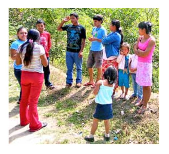
COLECTIVO DE MUJERES RURALES EMPOWERING RURAL WOMEN AND YOUTH, $11,620

CEPROSI works to improve the lives of impoverished women in the rural communities of Nindiri, Masaya. Through this project they trained 30 women to build improved stoves, provided training and technical support for 15 family gardens, continued to provide practical training in nutritious cooking and began to address the issues of men's violence.