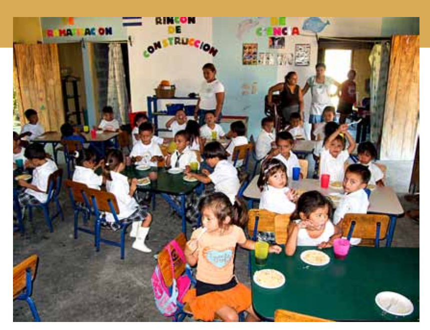
Children in ANDAR's preschool.

Honduras has a population of 7.7 million and is the poorest country in Central America. 62% of the population lives in poverty and nearly a quarter [23%] live in extreme poverty. Political instability since the coup d'état in June 2009 and high levels of violence continue to negatively impact people's lives and the country's development. We have 6 amazing partners who are working under very difficult conditions. They are working in the areas of: empowering women, supporting vulnerable preschool children, technical training for youth, food security and holistic community development.