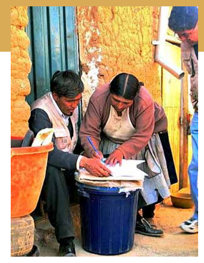
Signing paperwork to become a communal bank member.

Bolivia is a land locked country with a population of 10 million. It is the poorest and least developed country in South America. 60% of the population lives in poverty and 14% live in extreme poverty [less than $1.25/day]*. Most of the population is rural [74%] and indigenous [63%]. The life expectancy is only 67 years. We have 2 Canadian and 2 Bolivian partners working in the areas of: empowering women, increasing food security, fostering holistic community development and establishing rural community banks.