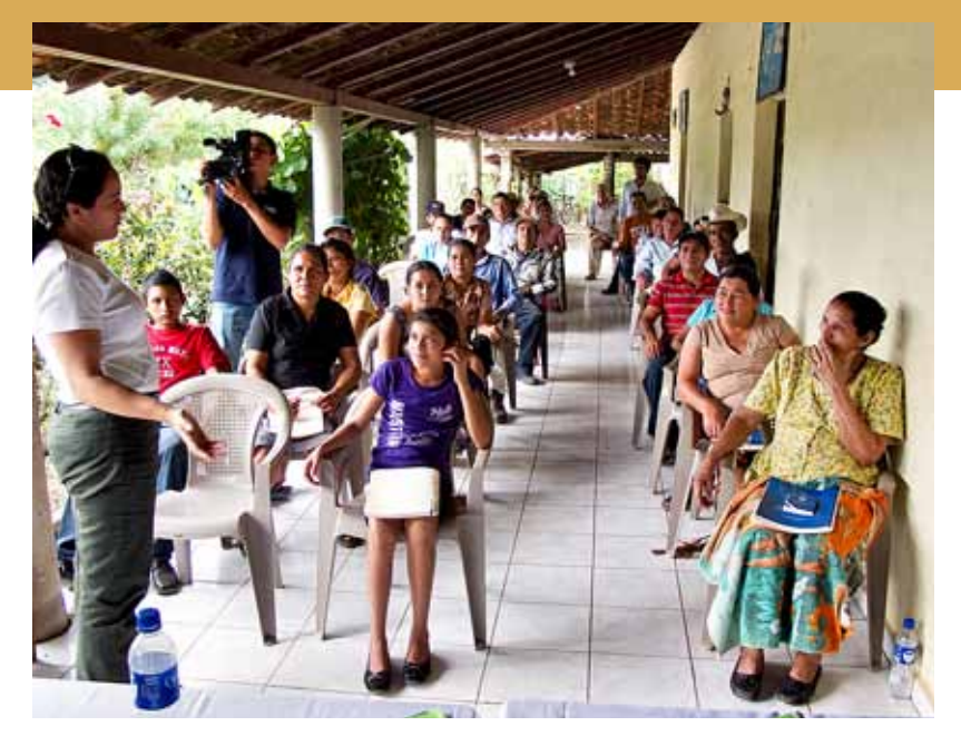
ADES human rights workshop.

El Salvador is a small densely populated country with 6.7 million people. The scars of the Civil War have left a very violent society with high levels of poverty. Over half of the population lives in poverty and 17% live in extreme poverty. We have 5 excellent partners in El Salvador and they are working in the areas of: human rights, food security, nutrition, health and opportunities for youth.