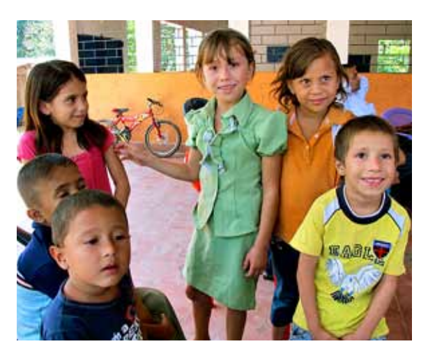
Children in FUSANMIDJ's nutrition program.

CENDIMOR supports children living in extreme poverty through provision of child nutrition, preschool education and tutoring support. In this project they are providing social and recreational opportunities for children at risk from 10 rural schools in El Limon, Soyapango. They are reaching 120 children through the provision of study clubs and opportunities for the children to participate in arts, dances, sports, a forum and an art festival.