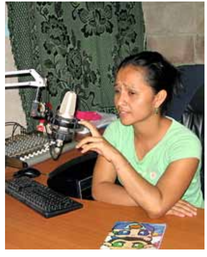
ADES human rights radio programs.