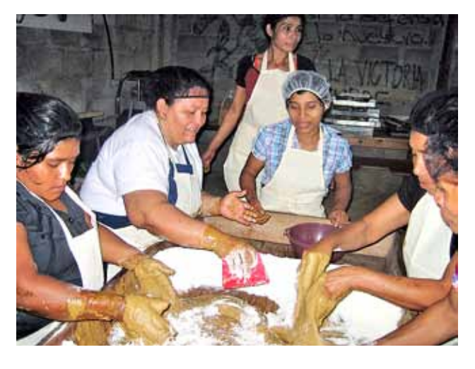
Women are learning how to make various types of bread.

COMUNDICH is an indigenous organization that works to eliminate discrimination and uphold human rights. Kenoli is supporting them to provide leadership training for 15 Chorti women in Chiquimula, strengthen food production through 3 community bakeries and promote community solidarity markets so that rural families can sell their produce.