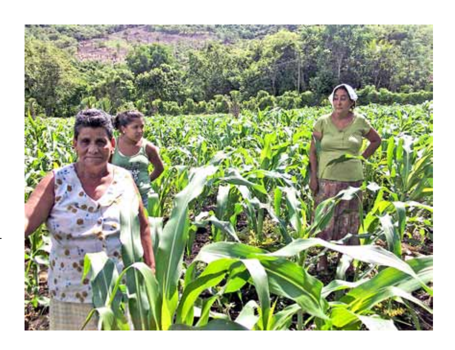
WORLD NEIGHBOURS CANADA / VECINOS HONDURAS

CODIMCA is a national women's organization that works to improve the conditions of women's lives. For this project, they received technical support through the Training Fund and worked with 130 women in El Paso, Santa Barbara and Copan in the production and marketing of grains, vegetables and other products. CODIMCA is also working through Via Campesina, a network of farmers' organizations, to promote agrarian reform.