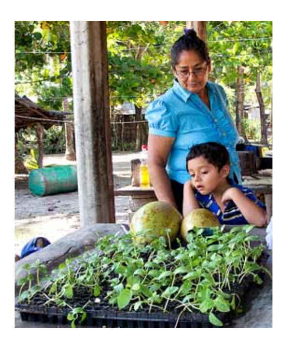
CENDIMOR's student study circle.

Association Mangle supports the communities that live in the biosphere reserve of Jiquilisco Bay, which is regularly flooded by the Lempa River. October 2011 saw unprecedented flooding and Kenoli provided some emergency aid, while the communities negotiated longer-term government assistance. In spite of the rains, this project trained farmers in 8 communities on sustainable agriculture, established 9 community gardens and 80 families benefitted with improved nutrition.